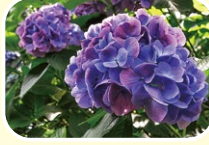
11 Hydrangea May June July

This is the average data of previous years. It is subject to change depending on the weather.