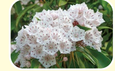
6 Mountain laurel May June July