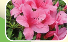
8 Satsuki (azalea) May June July