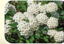
1 Reeves spirea May June July