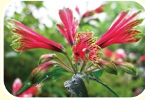
5 Peruvian lily May June July