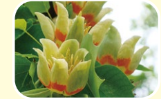
2 Tulip tree May June July