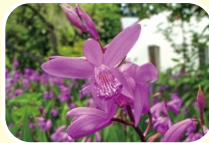
3 Hyacinth orchid May June July