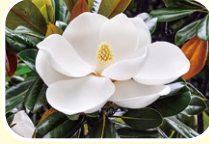
9 Large-flowered magnolia May June July