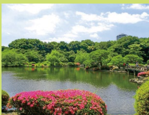
Japanese Traditional Garden

The present site of Shinjuku Gyoen was originally one part of Edo residence of the Lord Naito, the vassal of Ieyasu Tokugawa. In the Meiji era, it became an agricultural experiment station, and then in 1906 it was made into an imperial garden. After the war in 1949, it was opened to the public as a national garden. The garden contains three styles, Landscape Garden, Formal Garden, and Japanese Traditional Garden, and is considered to be one of the most important modern western style gardens in the Meiji era.