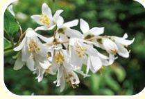
7 Deutzia May June July