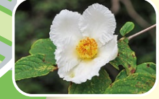
10 Japanese Stewartia May June July