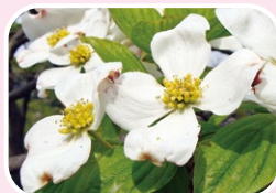
⑥ Flowering dogwood