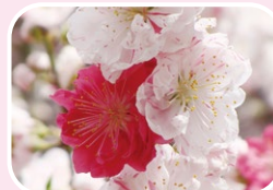
④ Peach 'Genpei'