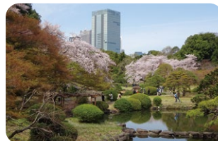
Japanese Traditional Garden