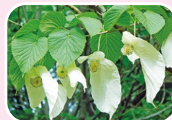
⑧ Dove tree