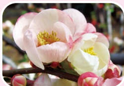
① Japanese quince