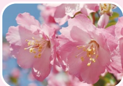
⑤ Hall crab apple