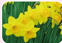
③ Wild daffodil