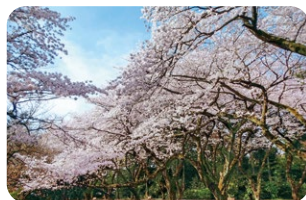
Cherry Tree Area