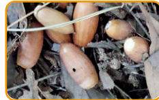
A house of insects