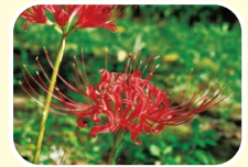
6 Red spider lily Sep. Oct. Nov.