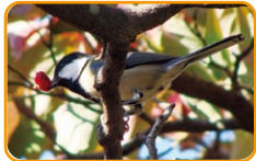
A titmouse with a dogwood berry in its mouth

Fruits are also important food and shelter for urban creatures, supporting their lives.