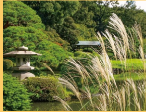
Japanese Traditional Garden

The present site of Shinjuku Gyoen was originally one part of Edo residence of the Lord Naito, the vassal of Ieyasu Tokugawa. In the Meiji era, it became an agricultural experiment station, and then in 1906 it was made into an imperial garden. After the war in 1949, it was opened to the public as a national garden. The garden contains three styles, Landscape Garden, Formal Garden, and Japanese Traditional Garden, and is considered to be one of the most important modern western style gardens in the Meiji era.