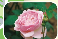
9 Rose Sep. Oct. Nov.