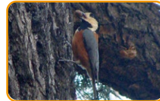
A varied tit hiding acorns in a tree