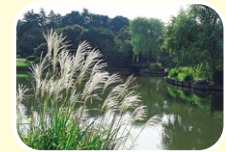
5 Eulalia Sep. Oct. Nov.