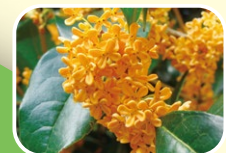
7 Fragrant olive Sep. Oct. Nov.