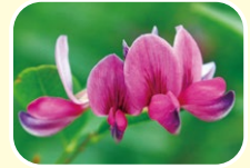
4 Bush clover Sep. Oct. Nov.