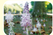
1 Scilla scilloides Sep. Oct. Nov.