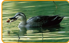
A spot-billed duck eating an acorn