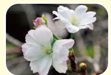
8 Cherry blossoms 'Jugatsu-zakura' Sep. Oct. Nov.