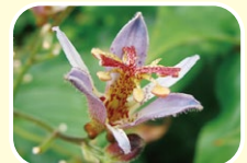
2 Taiwanese toad lily Sep. Oct. Nov.