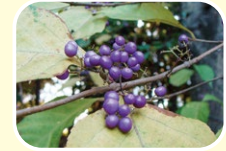
3 Japanese beautyberry Sep. Oct. Nov.