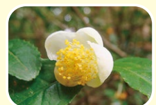
10 Tea plant Sep. Oct. Nov.

This is the average data of previous years. It is subject to change depending on the weather.